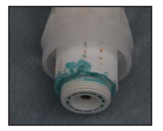
Figure 1. Salt residue build up.

Replacing seals on an injector is a great place to start and should be done annually, before the season starts. A