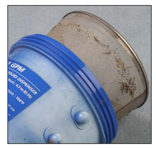
Figure 2. Clogged screen

Where trade names, proprietary products, or specific equipment are listed, no discrimination is intended and no endorsement, guarantee or warranty is implied by the authors, universities or associations.